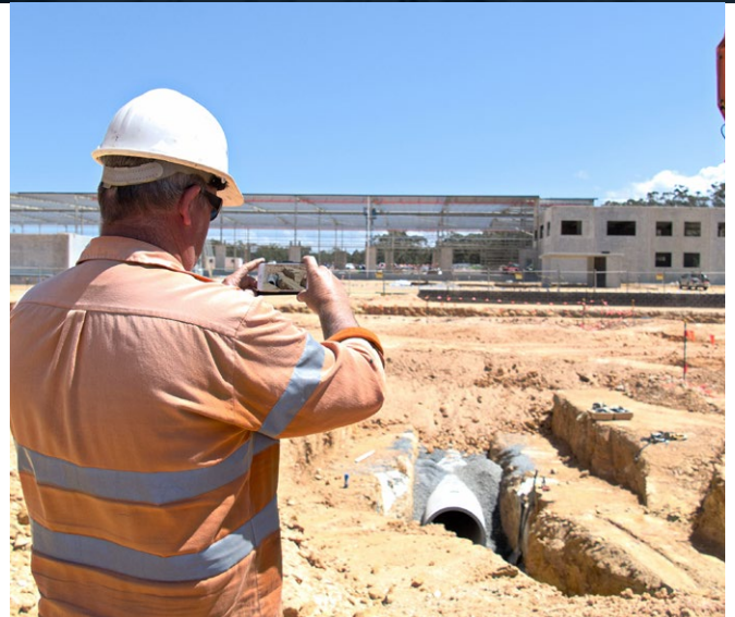
Capture progress directly in the field

For lump sum and schedule-of-rates projects, data that verifies progress claims has traditionally been captured in siloed spreadsheets, requiring significant manual effort to maintain, share and reconcile records. Envision supports the clear, indisputable and efficient verification of subcontractor claims. Actual progress is captured and assessed through standardised workflows, giving certainty and transparency to contractors and subcontractors. Discrepancies between claimed value and costs quickly highlight problems in progress estimates or subcontractor claims, improving cost and time management. Early visibility of expected monthly costs, ahead of receiving progress claims, further supports effective project cash flow management.